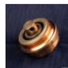
Soudronic Welding Machine